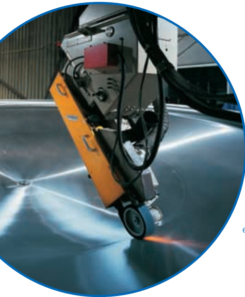
Automatic cone and bottom grinding machine for interior and exterior grindings up to Ra 0.5 \mu m