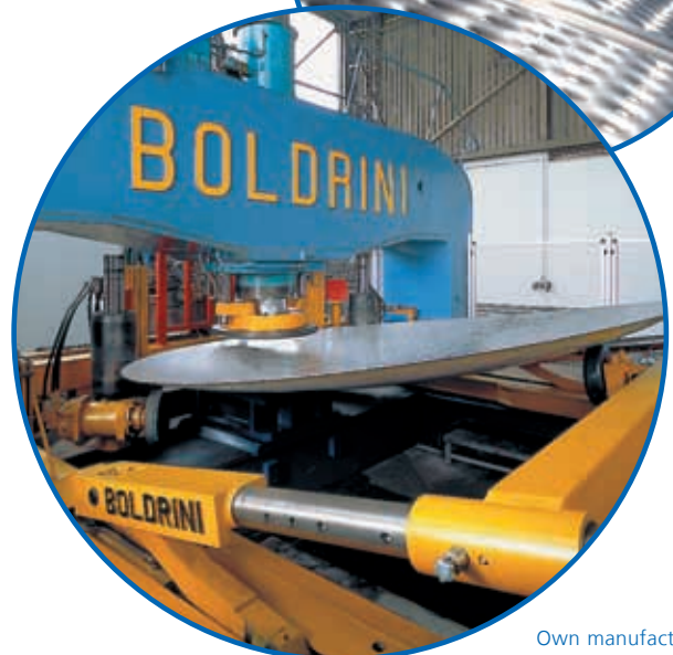
Own manufacturing of tank bottoms up to \varnothing 4 m